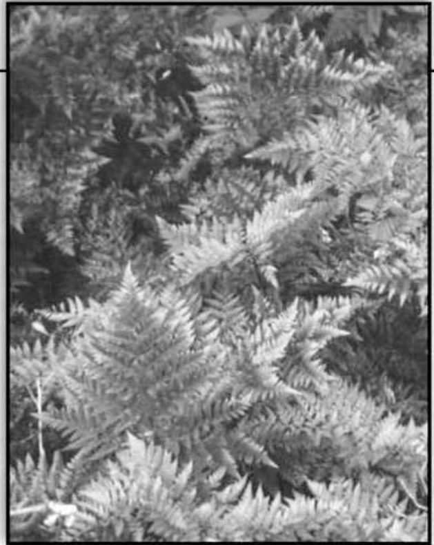
Chapter Photograph - Rumohra adiantiformis (Leatherleaf Fern)